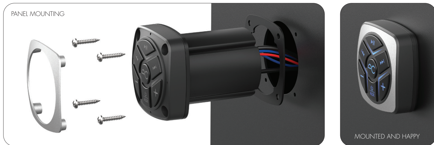
Mounting screws included.

Custom installation: mounting the ACX-BT3 to any panel is simple with integrated mounting holes which are concealed by the removable front bezel, and a handy gasket to keep pesky elements away from connections and wiring.