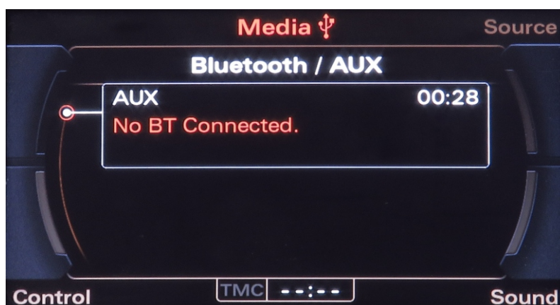
Screen view in the absence of a connected device.

IMPORTANT: AUX Line input can't control external device.