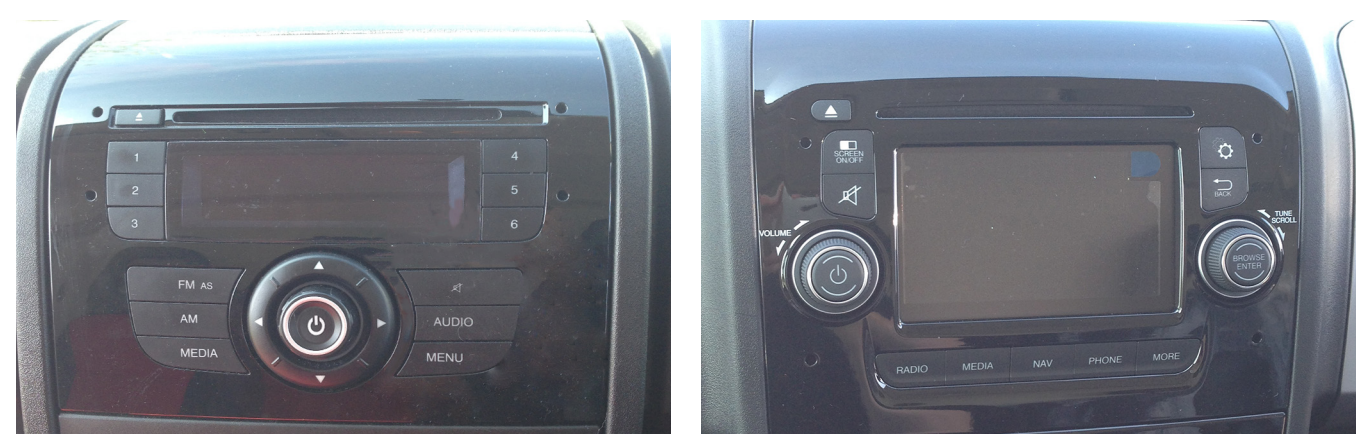
Basic (Mini ISO) Head Unit