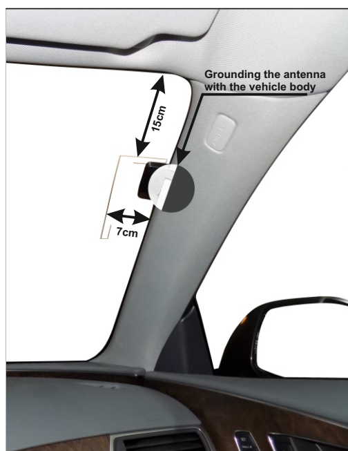
Example of mounting a DAB/DAB+ antenna