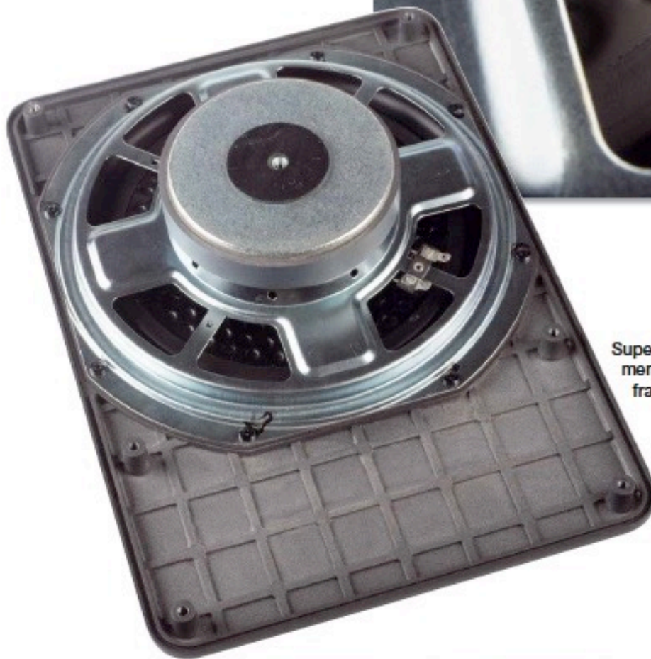
Super flat woofer thanks to its planar membrane that makes the shallow frame possible