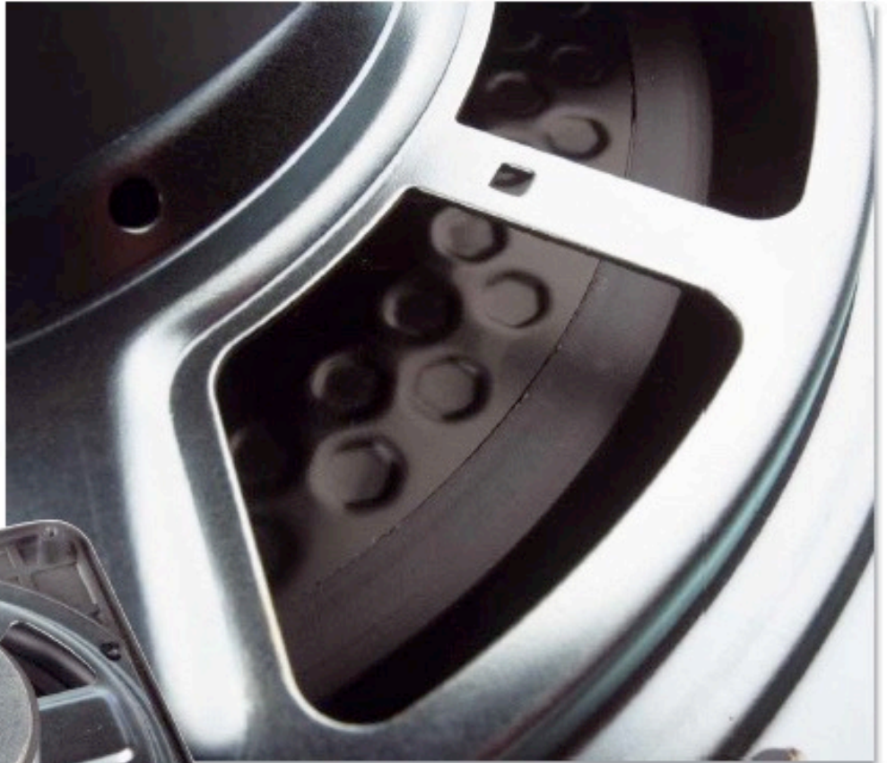
The woofer's cone is treated with embossings that remind of a golf ball

With the ZR10P, Phoenix Gold offers a subwoofer whose task is to bring a little bass into the car, but inconspicuously and without loss of space. Because not everyone wants to drive a full-blown bass box in the trunk, which also takes up space when the music is not playing. So it makes sense to look for a different type of subwoofer that ideally is easy to install and has enough bass for everyday use. There is space